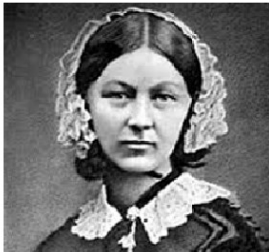
Florence Nightingale, the Mother of Modern Nursing (1820 – 1910)