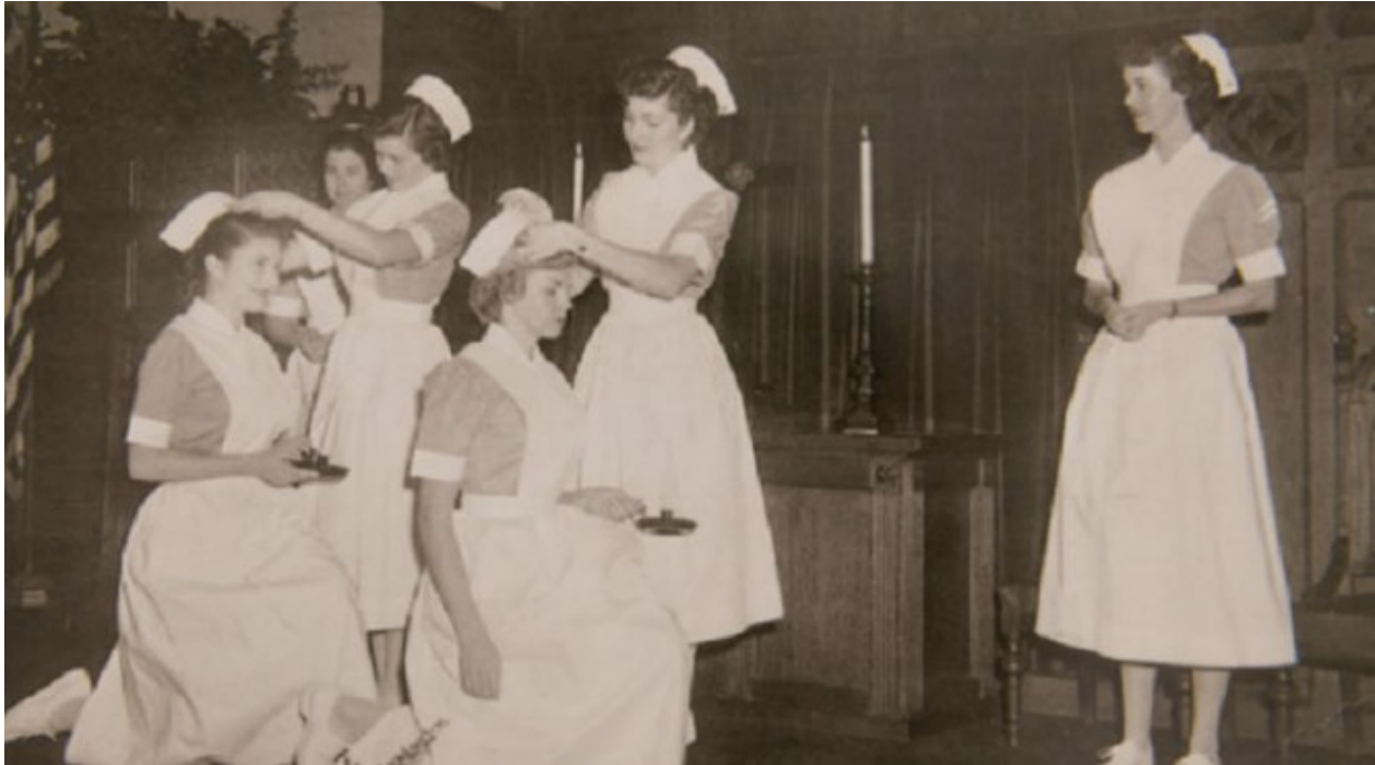
Capping Ceremony of students in Huntington Memorial Hospital School of Nursing (class of 1953). Note: Capping occurs at the end of probation upon successful completion of students' first semester in their nursing program.

Azusa Pacific University School of Nursing Monrovia Site 606 E. Huntington Dr. Monrovia, CA 91016-3637